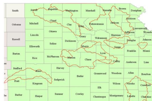
Eligible County RCPP Targeted Area

Landowners that are interested, should complete an application with their Conservation District Manager and District Forester. The application process is on a continual basis and will be evaluated at the end of each month. A deadline of May of the following year will be in place to complete the cost-share practices. Please contact your District Forester or Conservation District Manager if you have any questions. - Kansas Department of Agriculture Division of Conservation