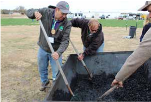
Visit the biochar demonstration to learn about carbon management and forestry.