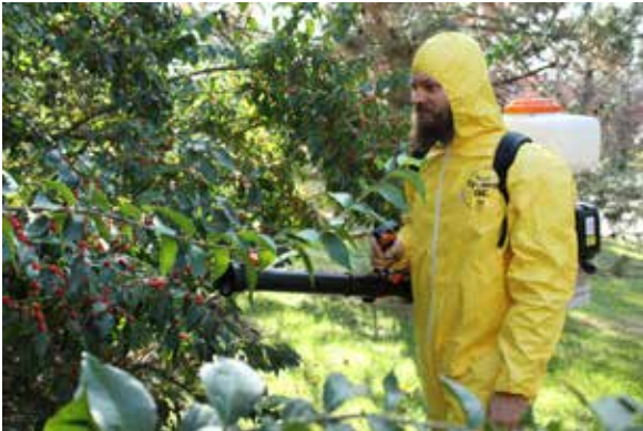
Asian bush honeysuckle is one invasive plant damaging Kansas landscapes.