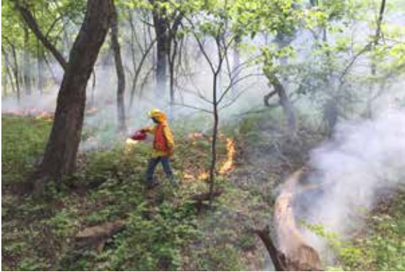
Prescribed fire is one valuable tool in managing Kansas woodlands.